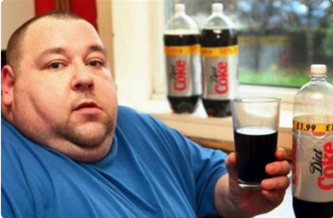
Me saying cheers (Happy Birthday)